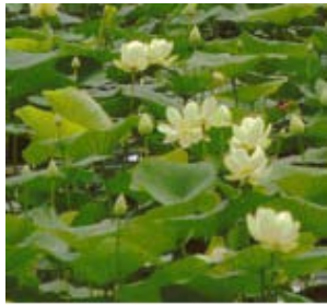
Lotus Blossom Festival Saturday, July 31 10 a.m. - 4 p.m.

New this year - the Mount Harmon Lotus Blossom Festival will showcase the plantation's rare American Lotus in peak bloom and pristine natural surroundings, & include special nature-inspired activities and exhibitors. The American Lotus, a relative of the water lily and the largest wildflower in the United States, is rare in Maryland and neighboring states, but abundant at Mount Harmon. FOMH Members & Children under 12 Free, Non-members $5