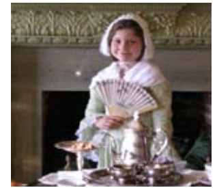
Yuletide Tour December 4 & 5 11am - 3pm

The Bull & Oyster Roast features Oysters on the Half-Shell & Roasted Oysters, Traditional Barbeque, Manor House Tours, Silent Auction & Live Music. This year the Bull & Oyster Roast will be held in conjunction with the Reenactment Festival, giving history and oyster lovers even more to enjoy! Cost is $50 per person.