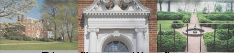
Tidewater Plantation and Nature Preserve