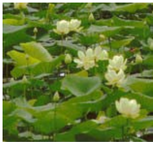
Lotus Blossom Festival Saturday, July 31 10 a.m. - 4 p.m.

New this year - the Mount Harmon Lotus Blossom Festival will showcase the plantation's rare American Lotus in peak bloom and pristine natural surroundings, & include special nature-inspired activities and exhibitors. The American Lotus, a relative of the water lily and the largest wildflower in the United States, is rare in Maryland and neighboring states, but abundant at Mount Harmon. FOMH Members & Children under 12 Free, Non-members $5