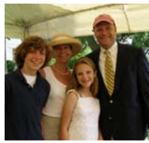
Bull & Oyster Roast, Saturday, October 23 5 p.m. - 8 p.m

We will host a full scale Revolutionary War Re-enactment & Colonial Festival, complete with British & Rebel Encampments, military skirmishes, tactical demonstrations, colonial crafts, manor house tours, food vendors & much more! Event runs from 10 a.m. to 3 p.m. FOMH Members $5, Non-members $10, Children under 12 Free